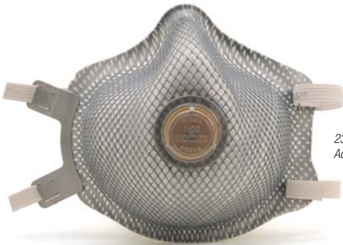
2315N99 Adjustable Cloth Strap