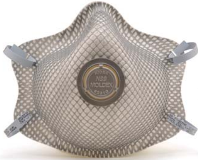
2310N99 Latex Strap