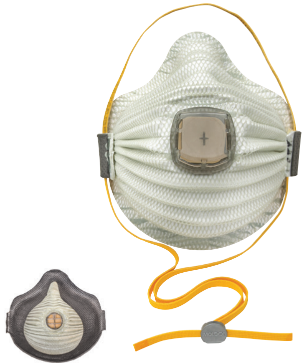
Foam Face Cushion

Metal Working, Grinding, Sanding, Sweeping, Bagging, Foundries, Pharmaceutical Operations, Power Plants, Environments where an OSHA substance specific standard applies (e.g., lead, cadmium, inorganic arsenic, MDA). Where oil mists are present, either alone or in combination with solid particulates, an R or P respirator must be used.