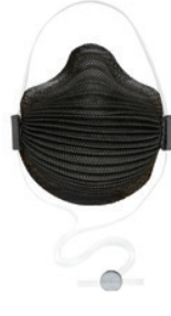
M4600V M4600 N95 Respirator AirWave® SmartStrap® Respirator 2 Per Pack / 40 Packs Per Case