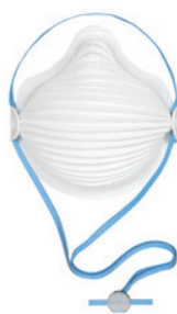
4600V 4600 N95 AirWave Respirator AirWave® SmartStrap® Respirator 2 Per Pack / 40 Packs Per Case