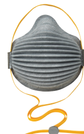
4800V 4800 N95 Plus Nuisance Organic Vapors AirWave® SmartStrap® Respirators 2 Per Pack / 40 Packs Per Case