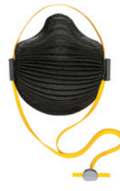
M4620V M4620 N95 AirWave® SmartStrap® Respirator 2 Per Pack / 40 Packs Per Case