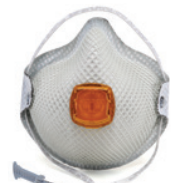
2800V 2800N95 Plus Nuisance Organic Vapors HandyStrap® Respirators with Ventex® Valve 2 Per Pack / 40 Packs Per Case