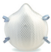
2200V 2200N95 Respirators 2 Per Pack / 50 Packs Per Case