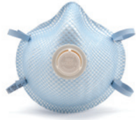
2300V 2300N95 Respirators 2 Per Pack / 40 Packs Per Case