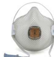
2700V 2700N95 HandyStrap® Respirator with Ventex® Valve 2 Per Pack / 40 Packs Per Case